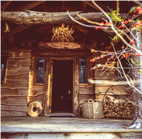
Exterior of Beaver Lodge

Beaver Lodge immerses guests in nature. Look out on Beaver Pond, or gaze up at an actual beaver lodge that forms a one-of-a-kind canopy over a bed with posts crafted from stones and gently curving tree trunks. Magic permeates every detail of this lofted two story lodge.