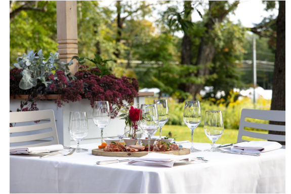
Seth Bird Patio

WHATEVER YOUR MOOD, YOUR TABLE IS WAITING.